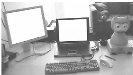
Fig. 2. Experimental setup.

Experimental design: All participants interacted with the text interface and one other personal assistant. One group ( N = 12 ) interacted with the physical iCat and the other