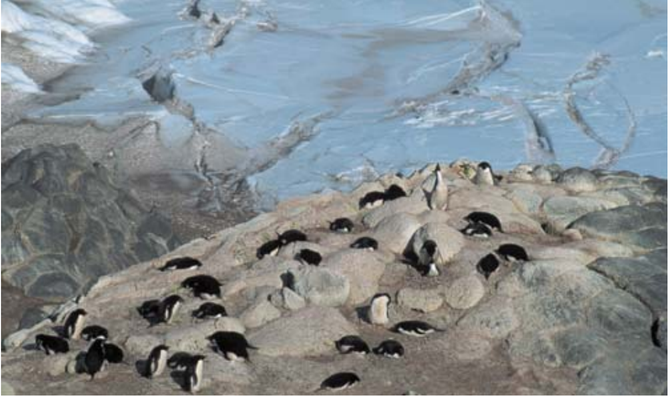
NESTING ADÉLIE PENGUINS suffer from increased snowfall, a consequence of climbing temperatures on the Antarctic Peninsula's western coast. Melting snow "addles" eggs, so they do not hatch.

"one more piece of evidence that our planet is changing."