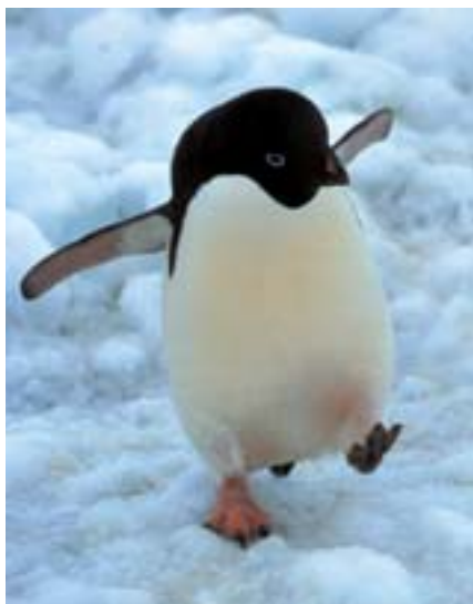
ADÉLIE PENGUIN is from a population near the U.S. research base at Palmer Station in Antarctica that has dropped 70 percent in three decades.