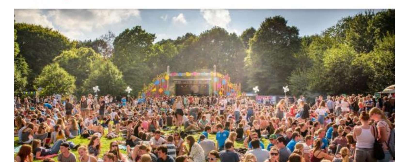
50e KEI-week: een duurzaam feestje