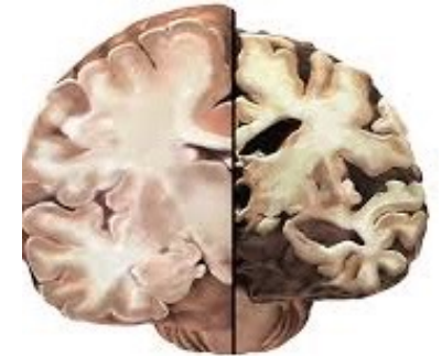
Molecular & Clinical Neurosciences