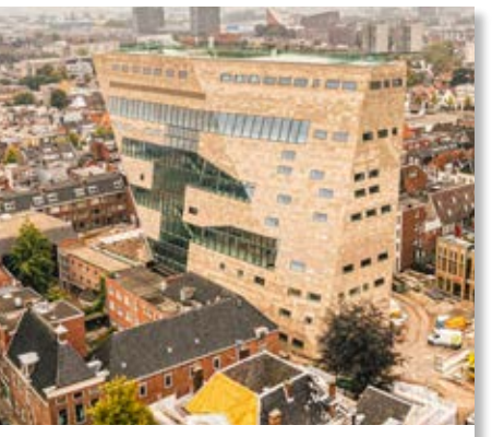
The Groningen Forum from above @matteoacitelli