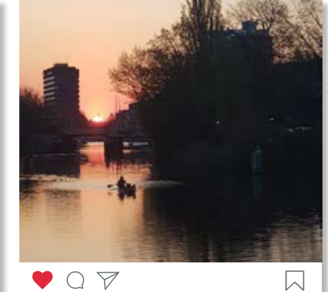
About last night aninaashleybach