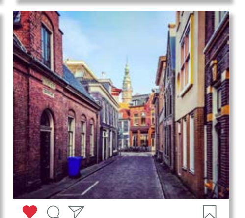
Good morning! @svendeligt_