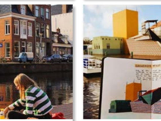
Groninger museum fun & creativity @mereljournals