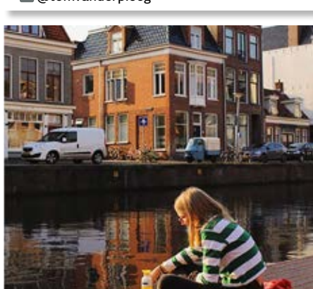
Canalside picnic @fxrtasse