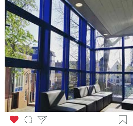
Favourite study spot? aellenanan