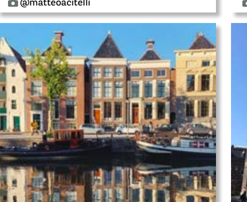
Sunshine and canals atomvanderploeg