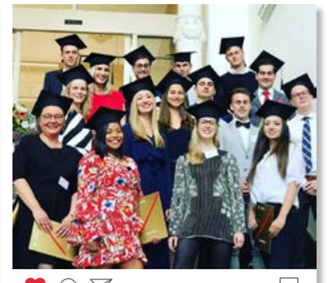
Best.Day.Ever a @campusfryslan