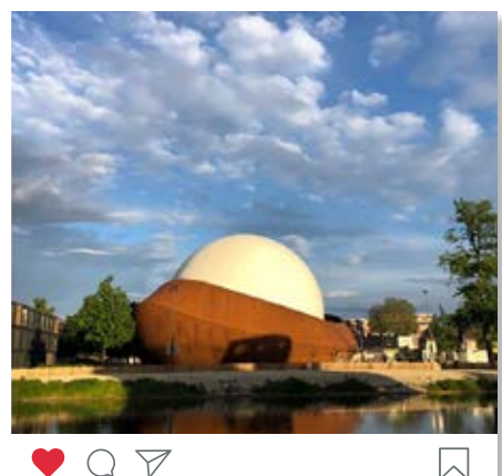
City beach anyone? ajeroenrek