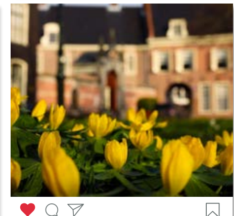
Flowers in the Prinsenhof in Groningen @mrofcolorsphotography