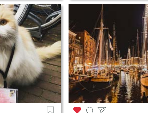
WinterWelvaart festival - Lage der Aa @ucgroningen