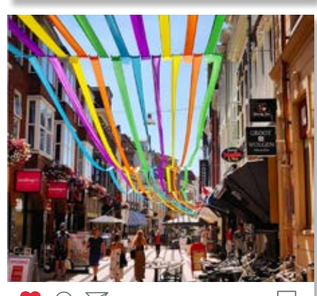
OF Sunny Friday in the city @asessr