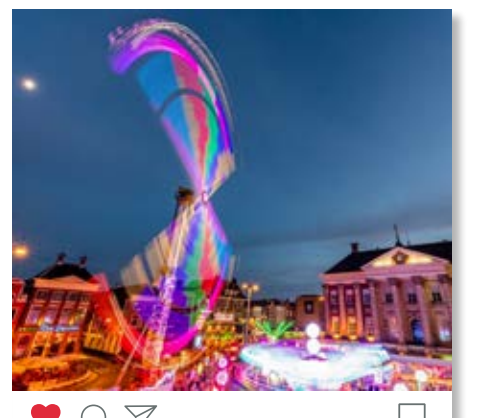
Annual funfair at Grote Markt

Follow us on Instagram @universityofgroningen