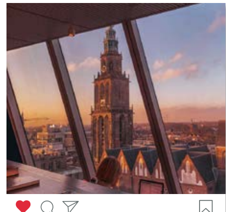
Views of the city from the Forum