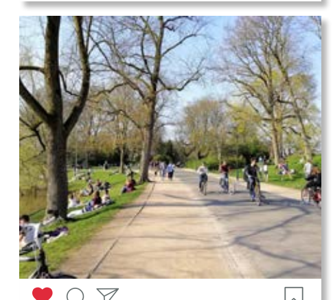
Sunny days in Noordeplantsoen @ellenanan