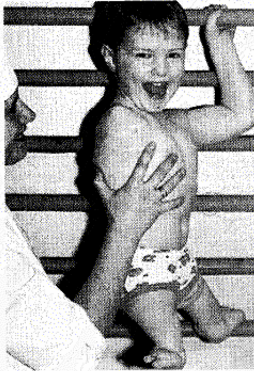
A victim of Chernobyl one year after the nuclear disaster.