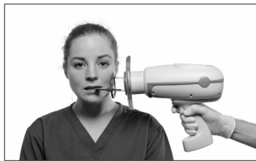
portable X-ray device